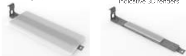
Indicative 3D renders

ESPAN® C3 CLIP Suitable for wall applications that require less than 5% coreflute cushioning tape.